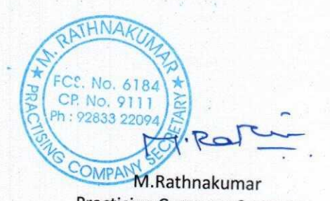
Practicing Company Secretary

Place: Chennai Date: 30<sup>th</sup> September 2016 FCS: Q\\\